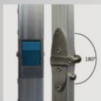
Joint Position 90° Degrees Folded

Multi-point positioning on four sides, snap-button operation, fast installation, ensure the flatness of the projection screen.