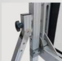
Five-star Handle Locked and Fixed