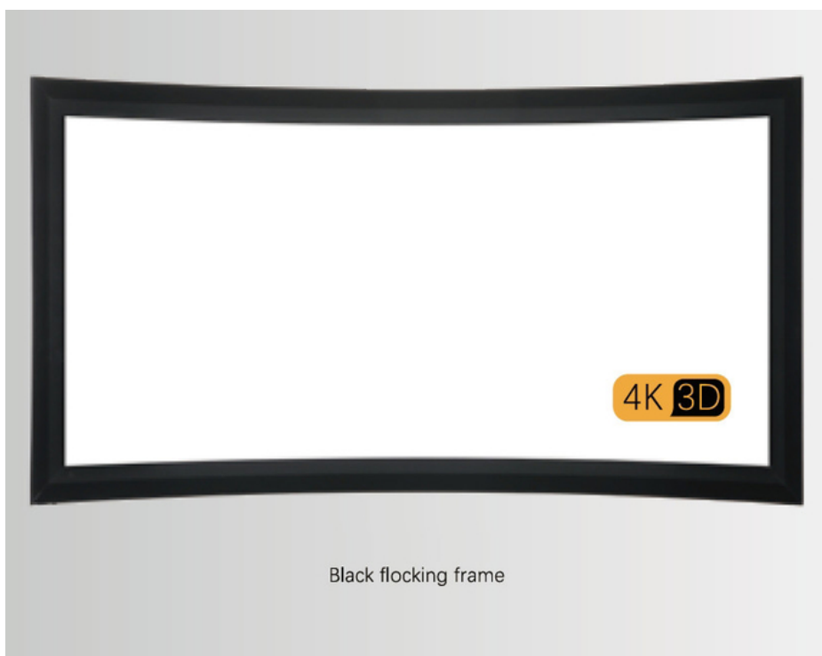
Black flocking frame