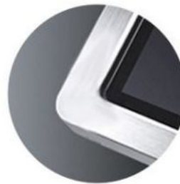
Rounded corner design, aluminum edging