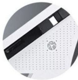
Thermal design porous heat dissipation