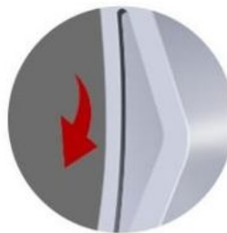
Ergonomic design and comfortable operation