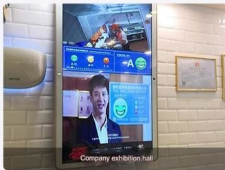
Company exhibition hall