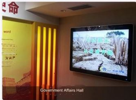
Government Affairs Hall