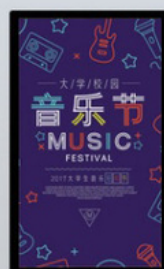
② vertical install