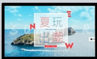
① horizontal install