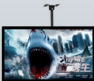
③ ceiling install